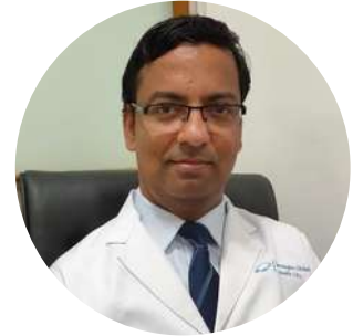
Dr. Sriram Global Hospital, Chennai