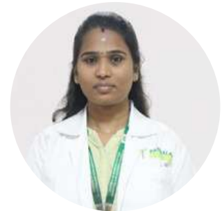
Dr. Padmashini Panimalar Hospital, Chennai